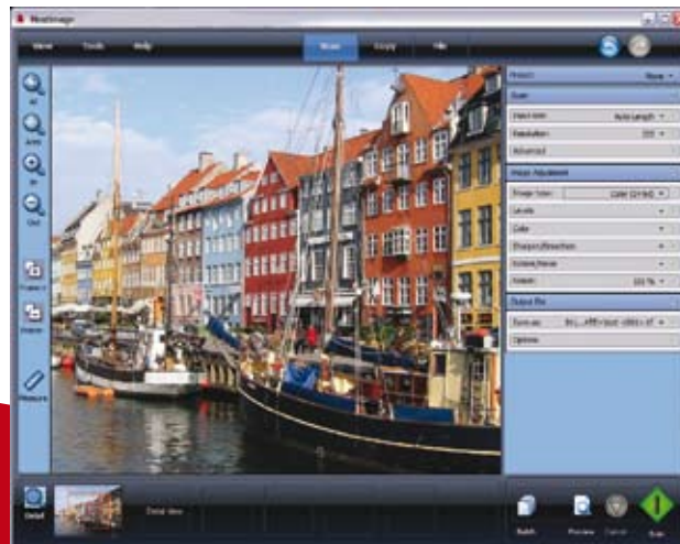
The easy-to-navigate Nextimage interface